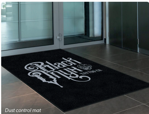
Dust control mat