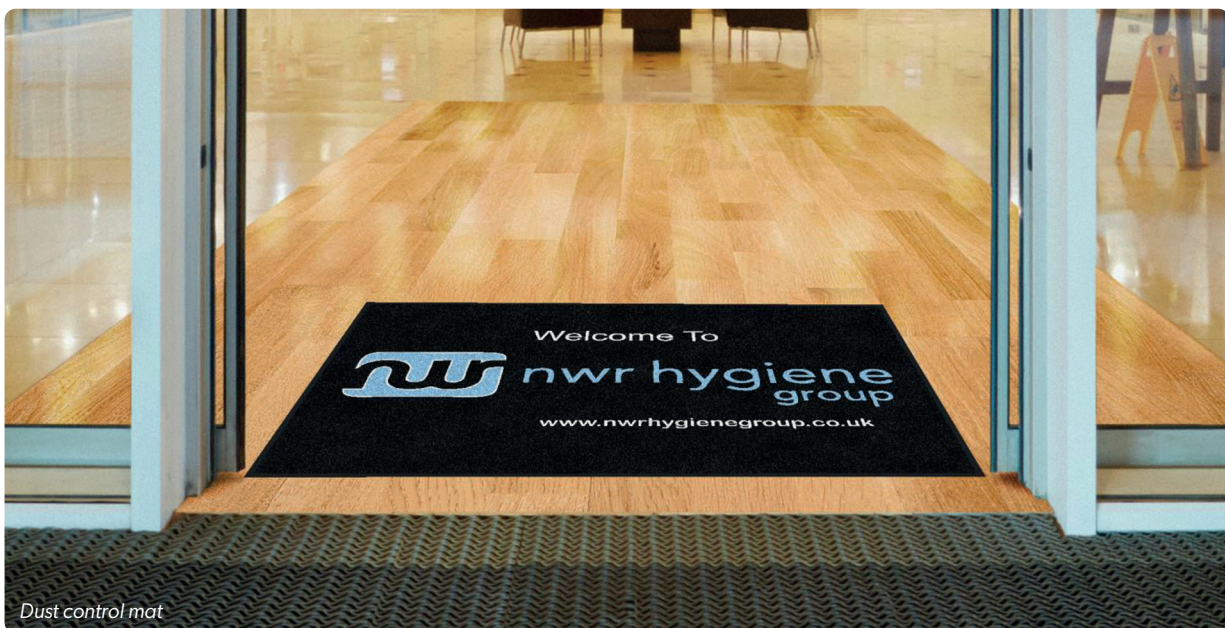
Dust control mat

The monofilament fibres work as touch scrapers, combined with high twist and heat set bicolour multi filament yarn which is designed for dirt and moisture absorption. These mats are available in a function grey colour.